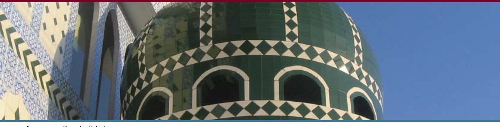
A mosque in Karachi, Pakistan

publication of highly controversial cartoons in the Danish press, mobs threatened Christian communities in a number of areas in Pakistan. In the town of Sukkur, in Sindh province, a crowd of Muslims burned down two churches, an attack that was triggered in part by rumors that a Christian man had committed blasphemy. Provincial authorities ordered an investigation into the incident and reportedly a number of people have been arrested. In August 2006, a church and several Christian homes were attacked in a village outside Lahore in what was called a dispute over land. Three Christians were injured after 35 Muslim men reportedly burned buildings and desecrated Bibles.