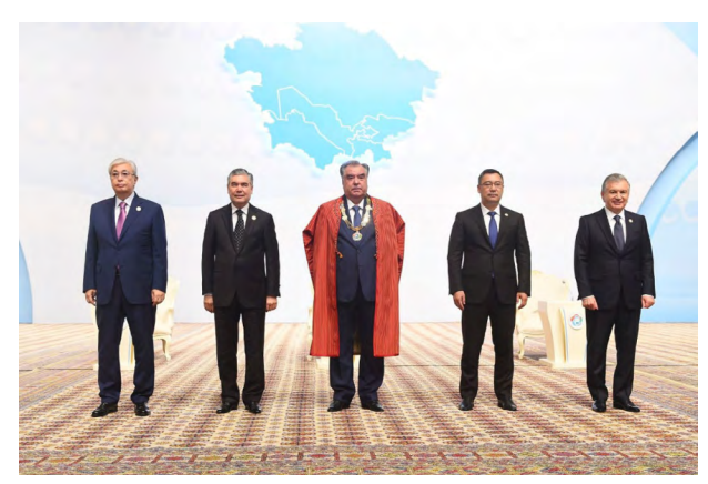
Rahmon at Summit of Central Asian leaders.

Tajikistan is a rising influence in regional organizations where, alongside powerful influences like China and Russia, it promotes problematic counterterrorism and counterextremism strategies that target peaceful religious practice and depict religious freedom and security as mutually exclusive. Rahmon's repressive policies against religiously-affiliated political opposition groups have also increased his prestige among neighboring states with a similar tendency to conflate counterterrorism and authoritarian overreach. At the third summit of Central Asian leaders in early August, as Afghanistan was falling to the Taliban, Rahmon was awarded the "Honorable Decoration of Heads of State of Central Asia" for "outstanding services" in the "consolidation of peace and security in the region," among other achievements.