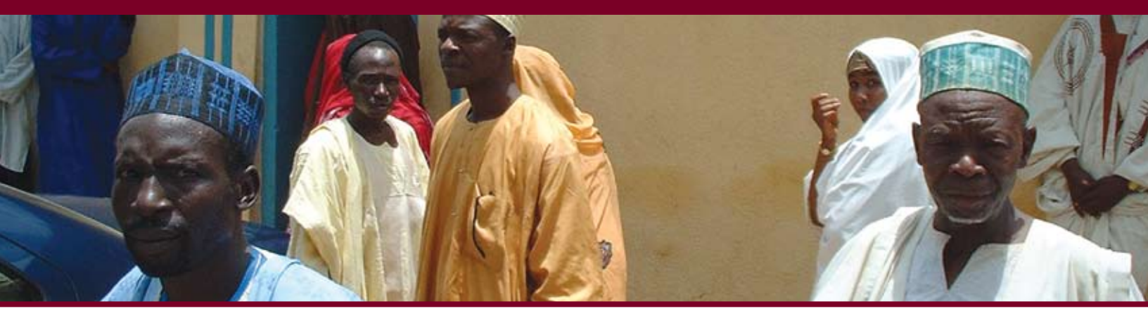
Zaria, northern Nigeria

trials that fall short of basic international legal standards. Defendants have limited rights of appeal and sometimes have no opportunity to seek legal representation. Women have faced particular discrimination under these codes, especially in adultery cases where pregnancy alone has been used as adequate evidence of guilt, and allegations of rape and sexual violence are rarely investigated by judges. In addition to criminal code changes that purportedly apply only to Muslims, some states have instituted or tolerated discriminatory practices such as banning the sale and consumption of alcohol and disadvantaging women in education, health care, and public transportation. These practices affect Muslims and non-Muslims alike. For example, in July 2005, the state government in Kano banned women from riding in the same buses as men and from riding behind men on motorcycles. Moreover, a few northern Nigerian states-Kano, Zamfara, and Katsina-have sanctioned quasi-official Hisbah (religious police) to enforce sharia violations and other discriminatory practices.