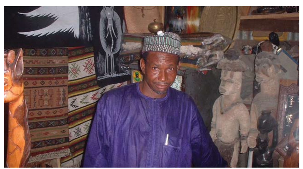
A Nigerian shopkeeper

The Commission has traveled twice to Nigeria, most recently in August 2003. In August 2004, the Commission issued a Policy Focus on Nigeria, which included recommendations for the U.S. government in relation to communal and sectarian violence, the expansion of sharia law in the north, discrimination against religious minorities, and increasing Islamic extremist activity. In addition, throughout the past year, Commission staff met with members of non-governmental organizations representing various religious communities in Nigeria, as well as human rights organizations, academics, and other Nigeria experts.