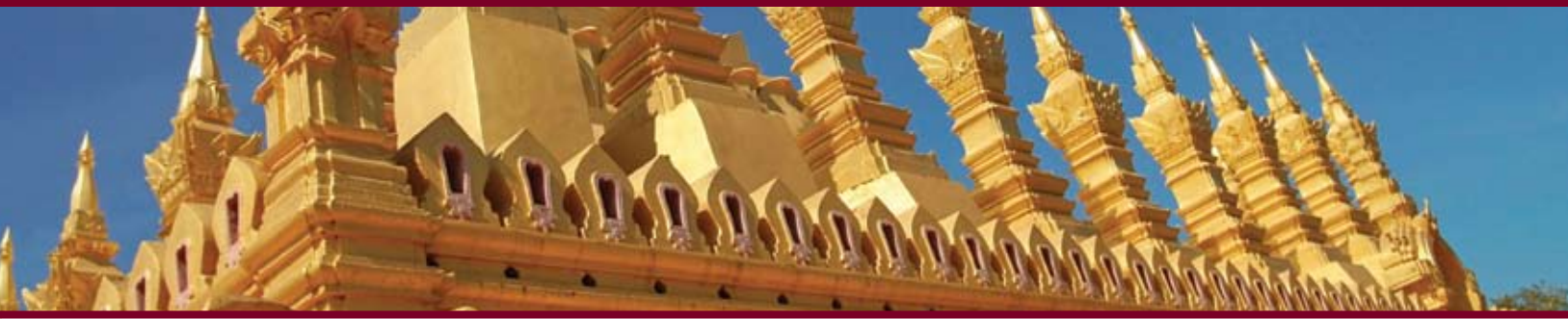
Pha That Luang Buddhist temple in Vientiane, Laos