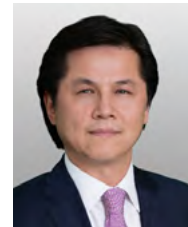
Commissioner Nury Turkel