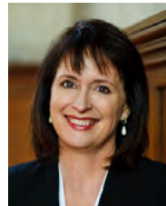
Commissioner Nadine Maenza